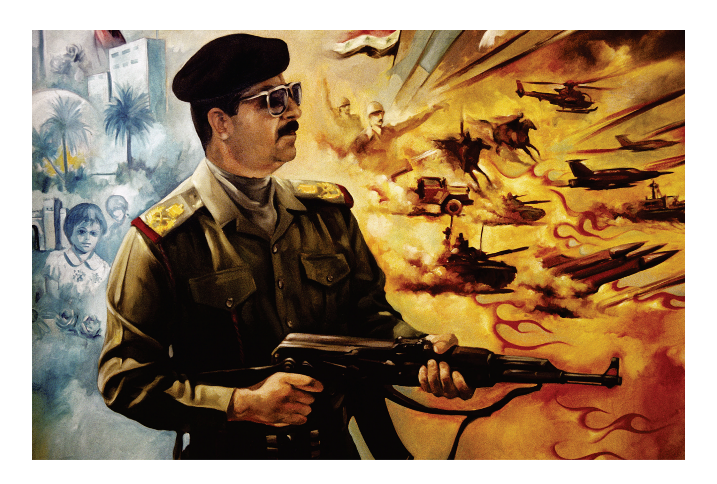
Source A A wall painting of Saddam Hussein completed in the 1990s. It was on display in Baghdad, the capital of Iraq.